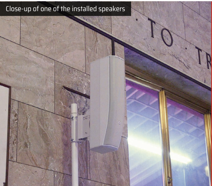
Close-up of one of the installed speakers

"From their care and concern for us as a customer, to their expertise in the field, I can't imagine another company coming in, doing what they did, and having the same outcome."